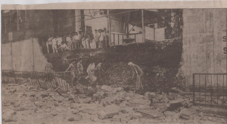
THE portion of the school fence that collapses: weakened by previous earthquakes.